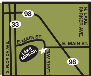
LAKE MIRROR THEATRE COMPLEX

10% Discounts on Classes and Workshops offered through Lakeland Community Theatre's education department and Theatre for Youth.