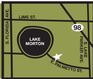
POLK MUSEUM OF ART