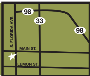
HISTORIC POLK THEATRE